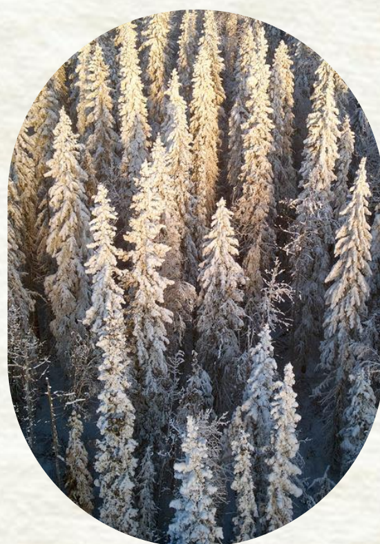
2. Carbon Markets & Carbon Offsets