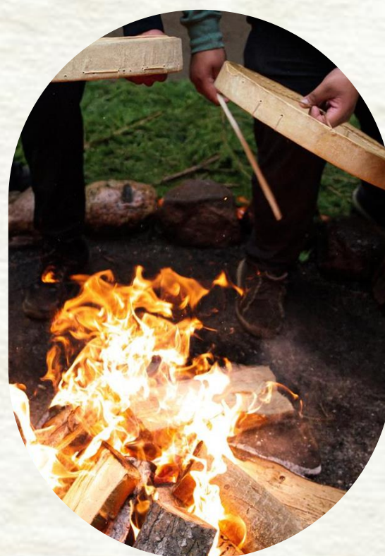
3. Implementing and Upholding First Nations Carbon Rights, Ownership & Entitlement