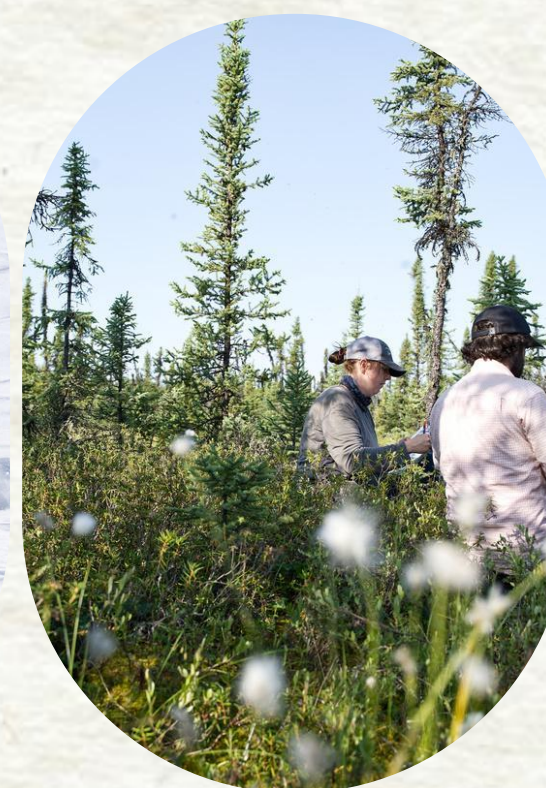
5. Planning Your Carbon Project