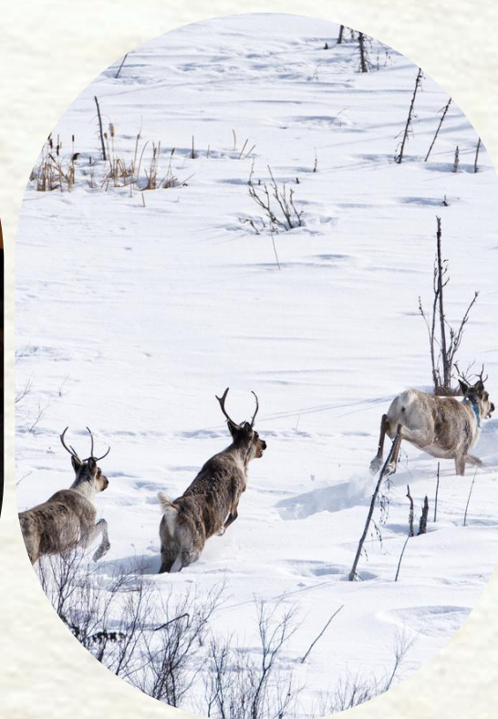
4. Opportunities, Barriers & Case Studies